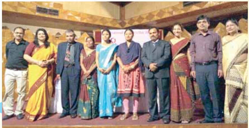
Women entrepreneurs with the Chief Guest, Chairman and other officials of the Bank