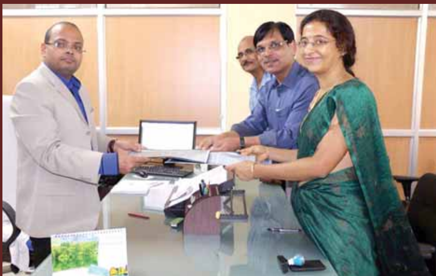
Exchange of MoU between ASRLM and AGVB

Assam Gramin Vikash Bank (AGVB) has entered into a Memorandum of Understanding with Assam State Rural Livelihood Mission (ASRLM) for operationalising the interest subvention scheme to eligible SHGs under NRLM in 23 districts of Assam. Under this scheme, all NRLM compliant Women SHGs will be eligible for Interest Subvention to avail credit upto Rs.3.00 lakh.