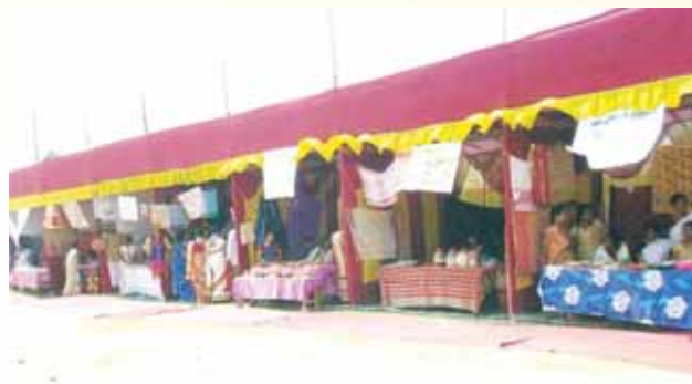
SHG stalls at Buyers – Sellers meet