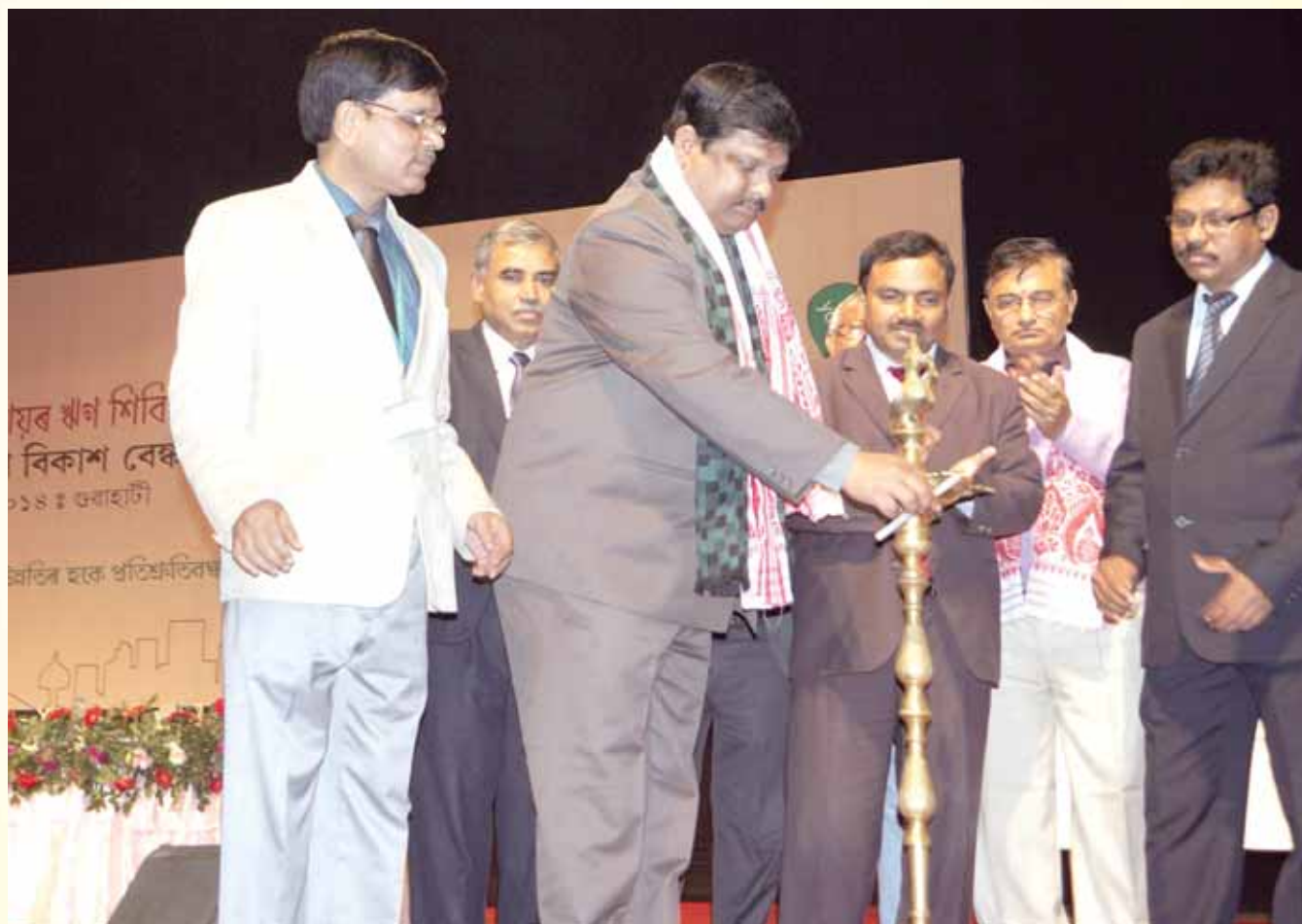
Lighting of lamp by Shri Rockybul Hussain, Minister, P&RD and Forest, Govt. of Assam in State Level Credit Camp

Inaugurating the Credit Camp, Shri Rockybul Hussain, Hon'ble Minister, Panchayat & Rural Development and Forest, Govt. of Assam lauded the efforts of AGVB for extending credit to over 75000 beneficiaries in a single day and called upon the other Banks to follow the example set by AGVB. The Minister also informed that due to the pro-active role of Assam Gramin Vikash Bank, the Govt. of Assam has given the responsibility of disbursement of wages of the MGNREGA beneficiaries in twelve districts of the State. The Minister also appreciated the steps taken by AGVB for implementation of Financial Inclusion Plan in the allotted villages. The Minister hoped that the initiatives of Assam Gramin Vikash Bank to provide credit at the door - step will usher in a new era for the people of Assam.