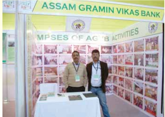
Bank's stall in the Agri-Horticultural Show

The show was first of its kind in the entire North Eastern Region and Indian Chamber Commerce left no stone unturned to make it a successful one. It was indeed a grand show. Participants having forward or backward linkages with the Agri-sector came out in large numbers to set up their stalls and showcased their works in their respective sector. This included all the agriculture deptt. of the NE states, all major Banks, Agricultural Universities, farm equipment manufacturers-both national & international, etc. Our Bank also put up a stall to show case the loan products designed by the Bank for Agri & allied sectors. The programme was also attended by top dignitaries of various State Governments.