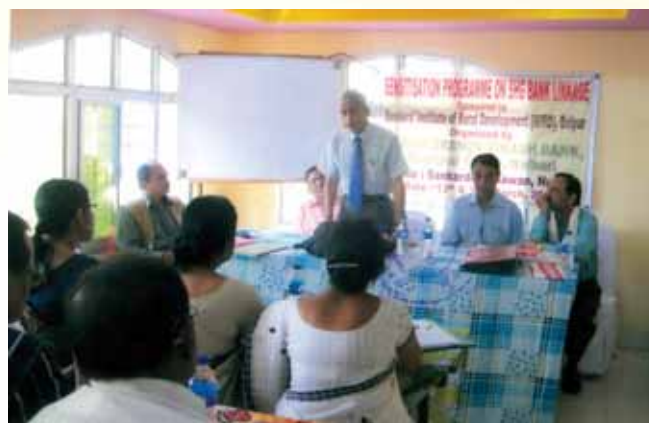
A view of the SHG – Bank Linkage training programme held at Nalbari