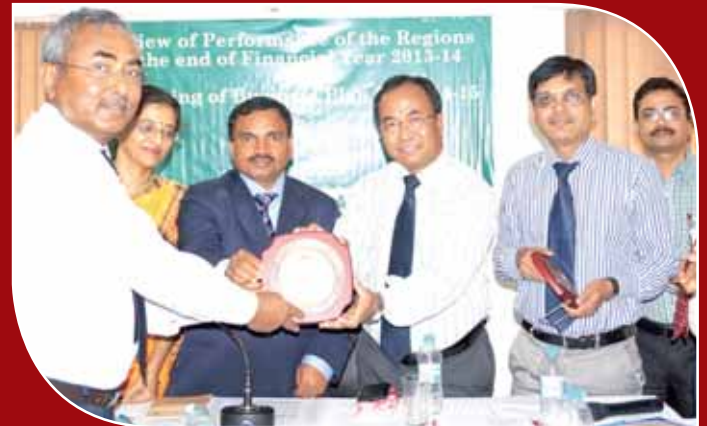
Regional Managers receiving the trophies