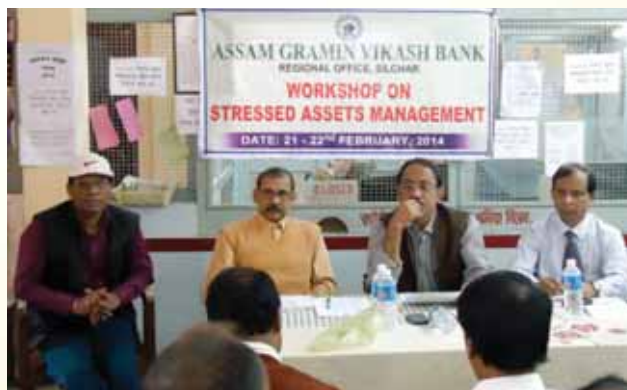
Stressed Assets Management Workshop at Silchar

The representatives of Head Office discussed at length the implications of stressed assets and how to recover the critical amount besides cleansing the data, wherever required. The participants of the programmes were found highly motivated after attending the programme and they resolved for regularisation of the stressed accounts before 31 st March, 2014.