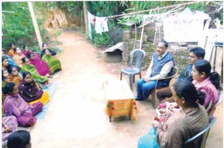
Financial Literacy camp organised at Suruj Nagar, Guwahati