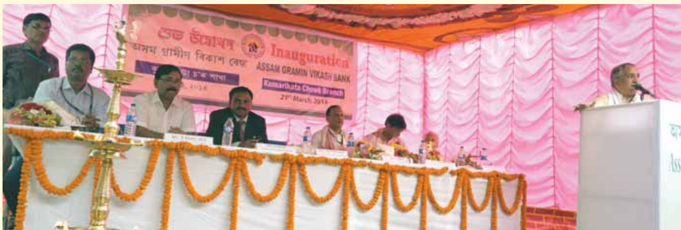
ED, RBI speaking at branch opening ceremony