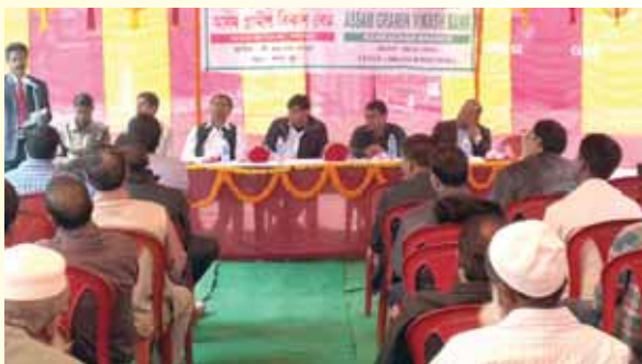
Opening ceremony of Mankachar branch