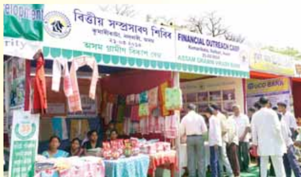
A view of AGVB's stall at Financial Outreach camp

Our Bank also participated in the Outreach camp and put up stall to educate the rural masses about Bank's products and another stall was also put up by Puwati SHG, financed by AGVB, Jagara branch.