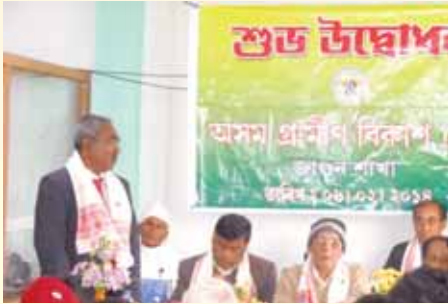
Opening ceremony of Jagun branch