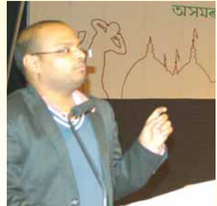
Shri Manoj Kumar, IAS, Mission Director, ASRLM speaking at the Credit camp

It is mention - worthy that in the Credit Camp, the Bank sanctioned / disbursed Rs.491.86 crore to 75034 beneficiaries covering Agriculture, MSME, Retail Credit, etc. Out of the total loans sanctioned / disbursed, Rs.175.43 crore was sanctioned / disbursed to 62482 beneficiaries under Agriculture sector, which included Rs.82.03 crore under Kisan Credit Card to 16360 farmers. On the other hand, Rs.170.74 crore was extended to MSME sector consisting of 4608 beneficiaries. Out of the total loans granted, Rs.403.18 crore went to Priority sector covering 73682 beneficiaries.