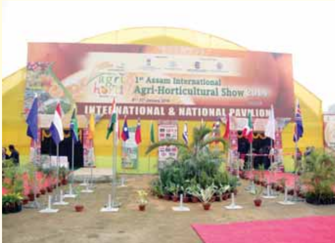
View of the Agri-Horticultural Show

The Bank participated in the 1 st Assam International Agri-Horticultural Show, 2014 held from 8 th -12 th January, 2014 at College of Veterinary Science Playground, Khanapara, Guwahati. The programme was a joint initiative of Agriculture Deptt, Govt. of Assam and Indian Chamber of Commerce (ICC), NE Chapter.