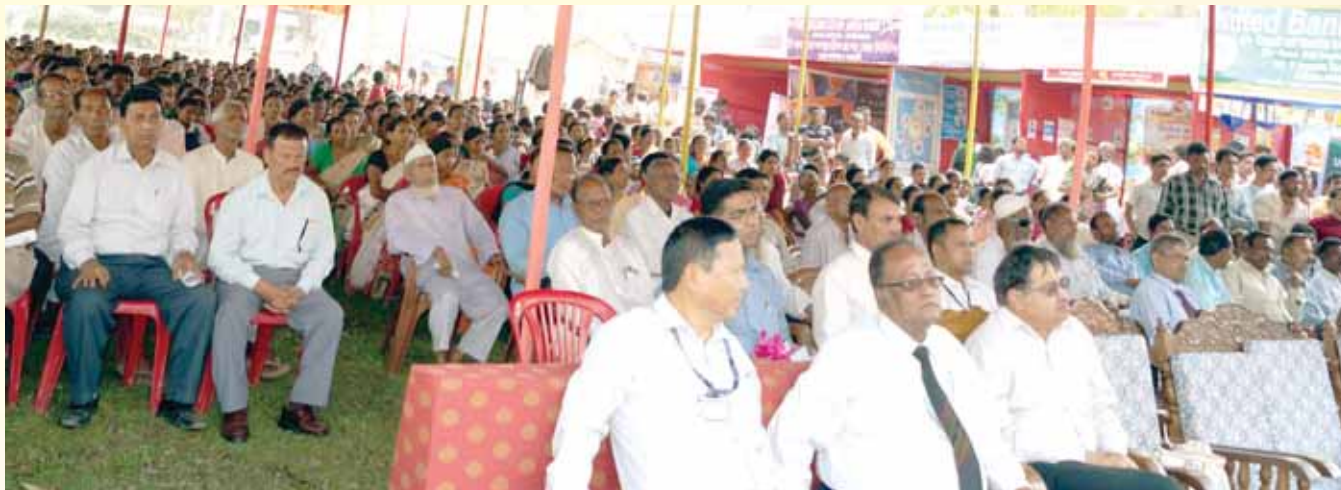
Local people and dignitaries present in the Financial Outreach camp at Kumarikata village

Earlier, the staff of RBI, Guwahati staged a play on Financial Literacy. The school children of Kumarikata village enthralled the audience by their Bihu dance followed by a song.