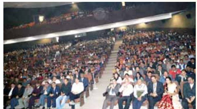
A section of audience in the Credit camp