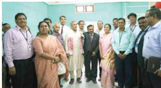
Top officials of RBI, NABARD, AGVB, UCO Bank with ED, RBI inside Kumarihata Chowk branch premises