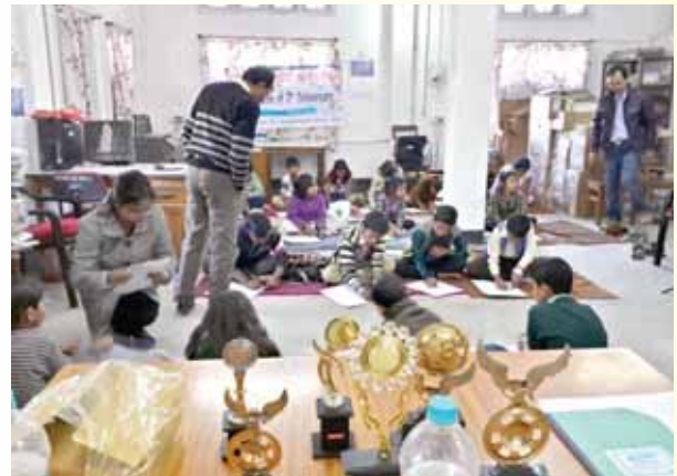
Sit & Draw competition organised by Kokrajhar Regional Office to mark 8 th Anniversary of the Bank

Regional Offices of the Bank organised Sit & Draw competition amongst the school children in two groups, viz, Junior and Senior. Cash prizes were given to the winners of the 1 st , 2 nd and 3 rd prizes in each group.