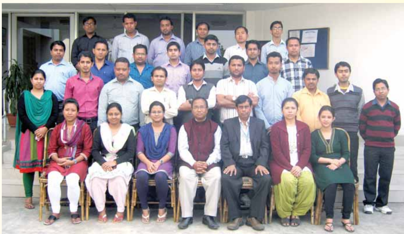
A group of newly recruited Officers attending the Induction Training Programme at IIBM, Guwahati

Induction Training for newly recruited Officers in Scale II and I were conducted at the Indian Institute of Bank Management (IIBM), Guwahati in three batches (27 th -31 st January, 2014; 10 th -14 th February, 2014; 3 rd -7 th March, 2014) covering 85 participants. The programmes were residential, covering a wide gamut of areas such as Indian Financial System, Banking Structure, RBI: Role and Functions, Basics of Accounting Opening of Various kinds of Accounts, General Principles of Lending, NPA & Recovery Mechanisms, Financial Inclusion, Inspection & Audit Process, Business administration & CBS, Negotiable Instruments Act, Concept of Branch Profitability, Customer Service, Team Building & Motivation, etc. Topics specific to the Bank such as Various Deposit Products as well as Retail Loan Products of the Bank and their Marketing Strategies, Service Regulation of the Bank were also covered in the said training programme. The various topics were taken up by both the in-house faculty of the Institute as well as the senior officials of the Bank.