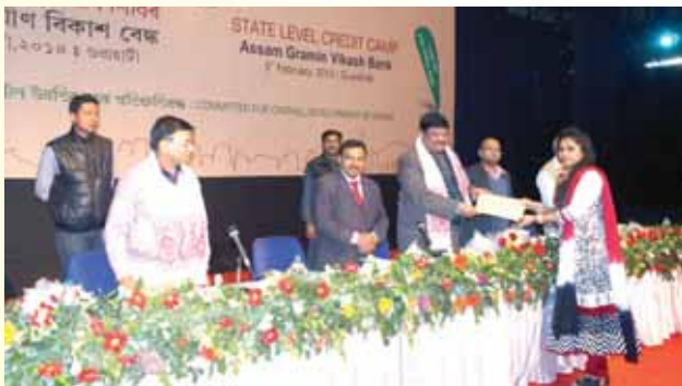
Shri Rockybul Hussain, Minister, P&RD and Forest, Govt. of Assam distributing sanction letter to a borrower

It is mention - worthy that in the Credit Camp, the Bank sanctioned / disbursed Rs.491.86 crore to 75034 beneficiaries covering Agriculture, MSME, Retail Credit, etc. Out of the total loans sanctioned / disbursed, Rs.175.43 crore was sanctioned / disbursed to 62482 beneficiaries under Agriculture sector, which included Rs.82.03 crore under Kisan Credit Card to 16360 farmers. On the other hand, Rs.170.74 crore was extended to MSME sector consisting of 4608 beneficiaries. Out of the total loans granted, Rs.403.18 crore went to Priority sector covering 73682 beneficiaries.