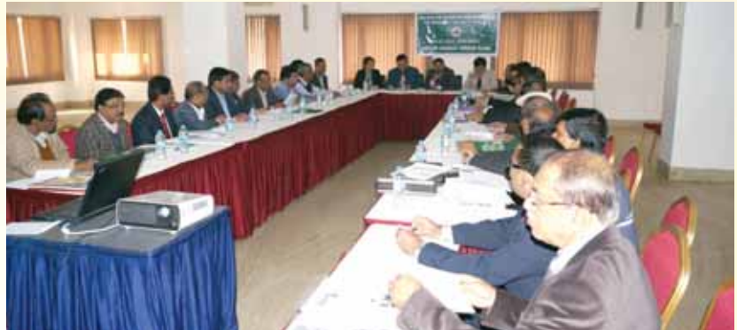
A view of the Review meet held at Hotel Grand Starline, Guwahati