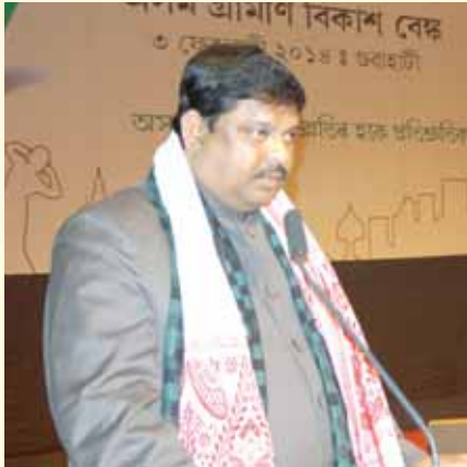
Shri Rockybul Hussain, Hon'ble Minister delivering inaugural speech

The other dignitaries, in their addresses, expressed happiness in various initiatives taken by the Bank for the uplift of the economy of the State as well as solving unemployment problems. Further, the dignitaries were impressed seeing the huge gathering and appreciated the efforts made by the Bank in successful organisation of such a mega event which is considered to be the largest Credit Camp organised by any Bank in the entire N. E. Region.